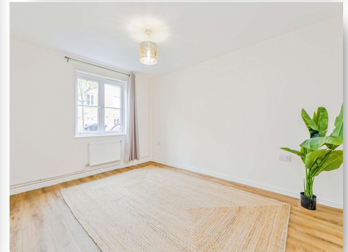
Ffordd Nowell, Penylan Cardiff CF23 9FA