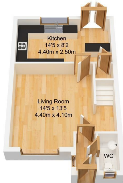
Ground Floor Approx. 31.18 sqm. (335.61 sqft.)