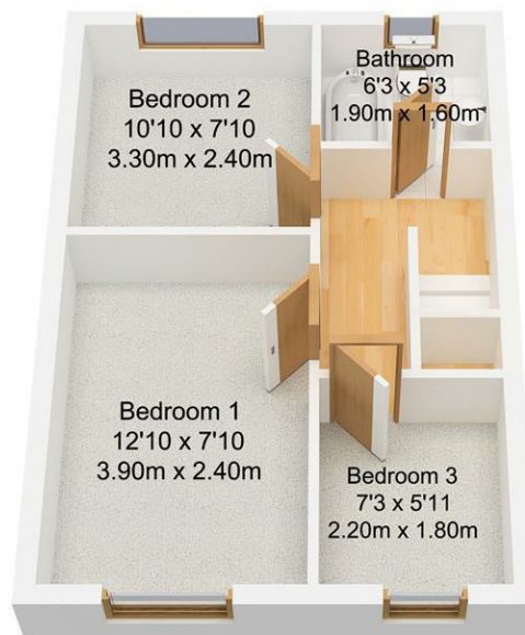
First Floor Approx. 29.48 sqm. (317.32 sqft.)