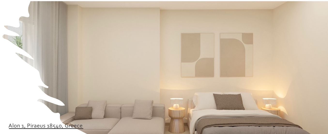
Alon 1, Piraeus 18540, Greece