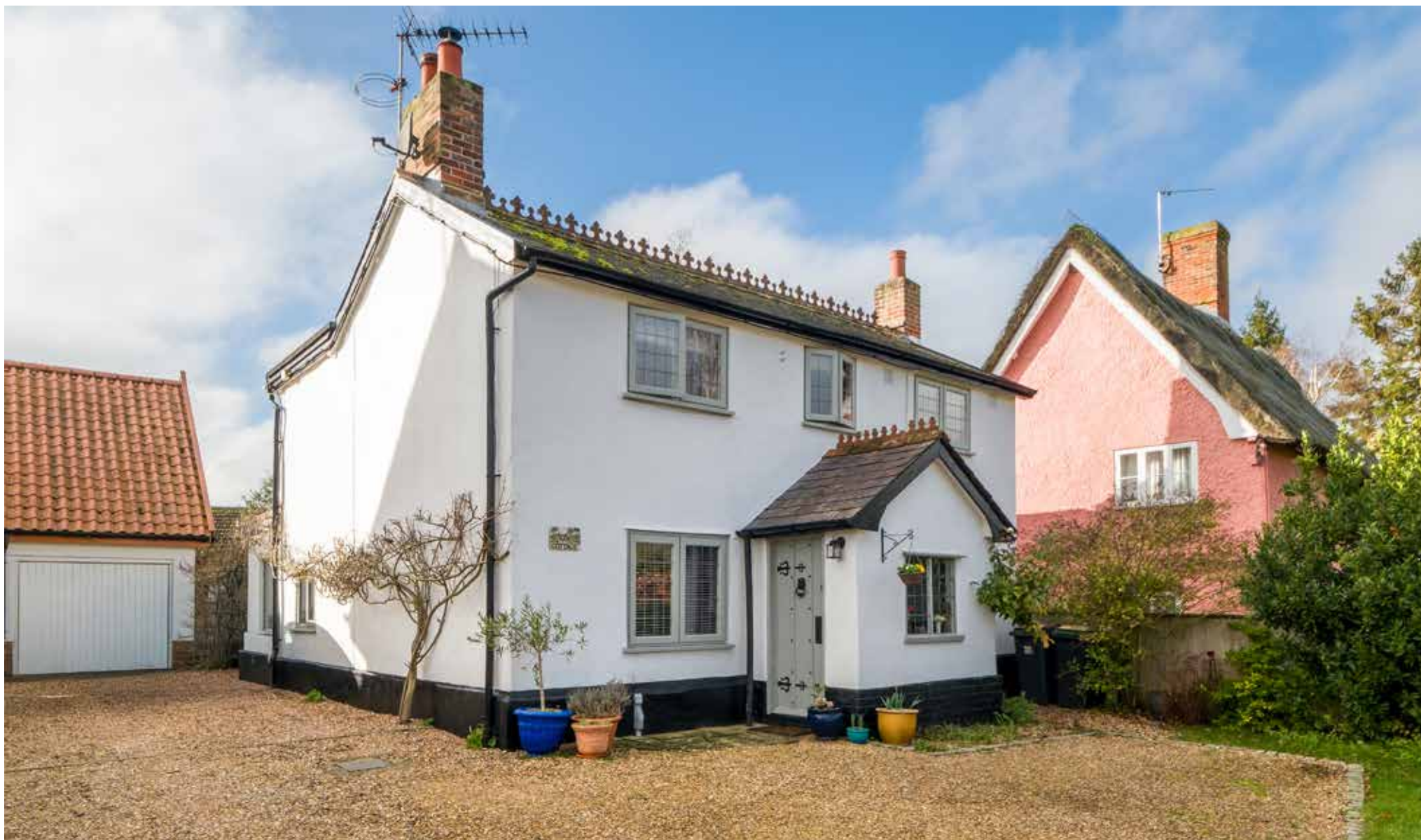
Ark Cottage Mendlesham | Stowmarket | Suffolk | IP14 5SQ