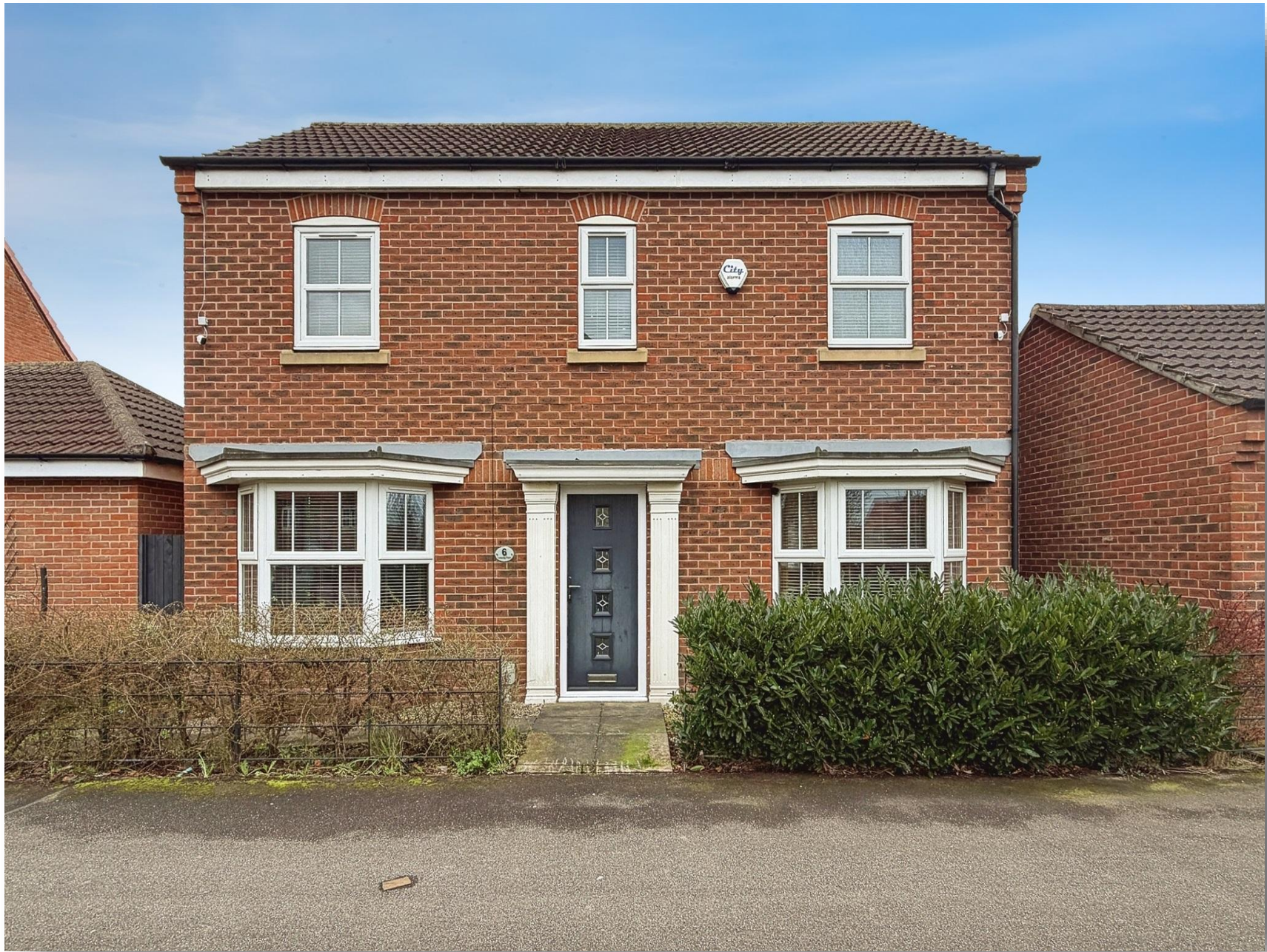
Loseley Park, Kingswood, Hull, HU7 3GJ