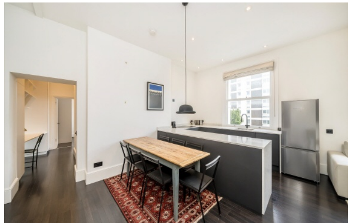
Ladbroke Grove, W11