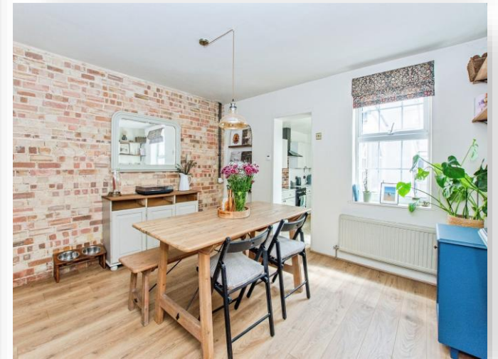
Fridaybridge Road, Elm Wisbech PE14 0AT