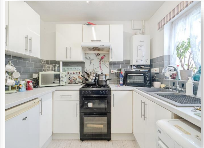
Peregrine Rise, Leicester LE4 1DR