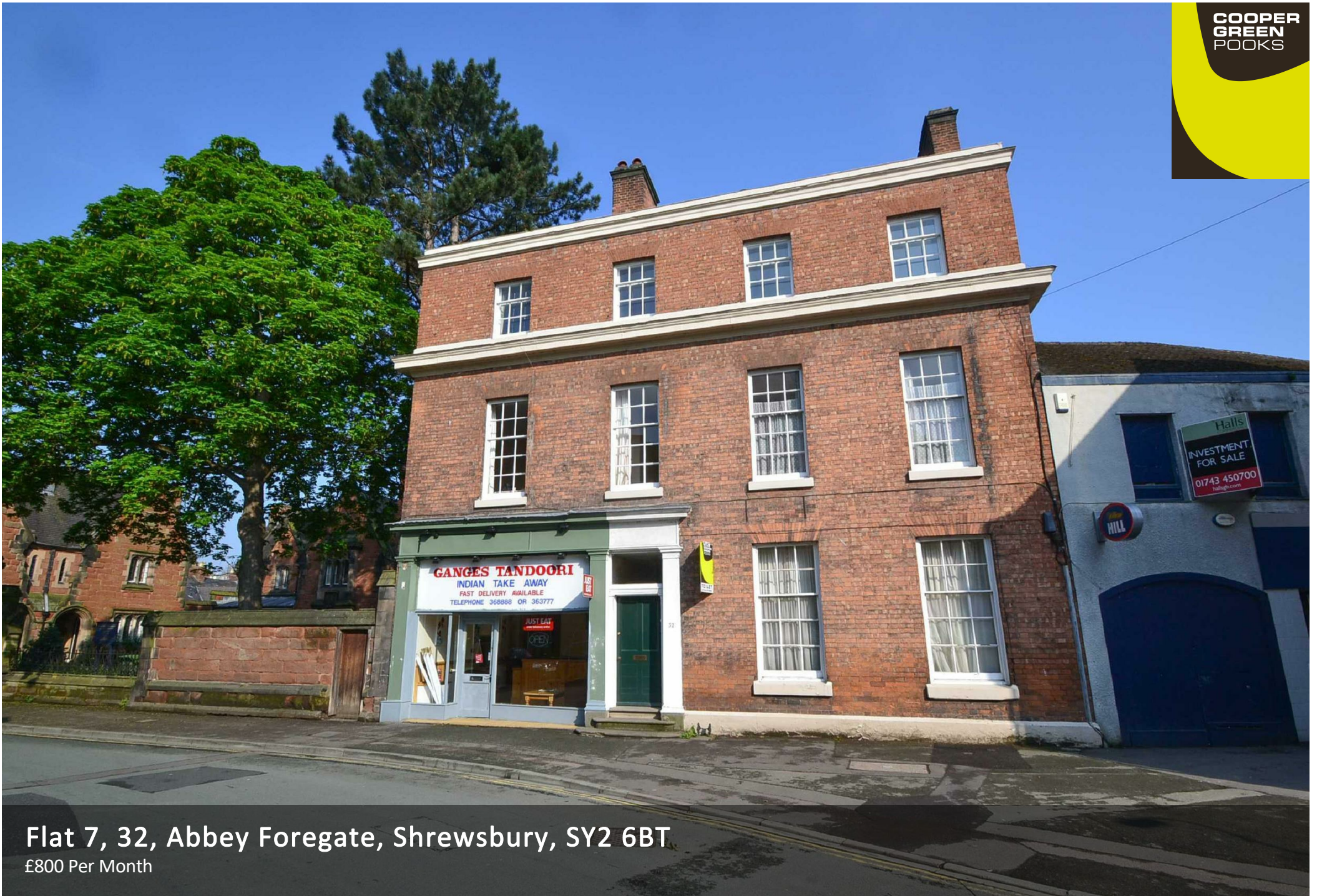
Flat 7, 32, Abbey Foregate, Shrewsbury, SY2 6BT £800 Per Month