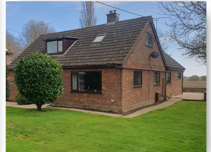
Badgers Mount, Church Road, Stowupland, Stowmarket, IP14 4BJ