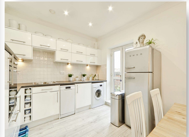
Astoria Court Gledhow Valley Road, Leeds LS8 4DP