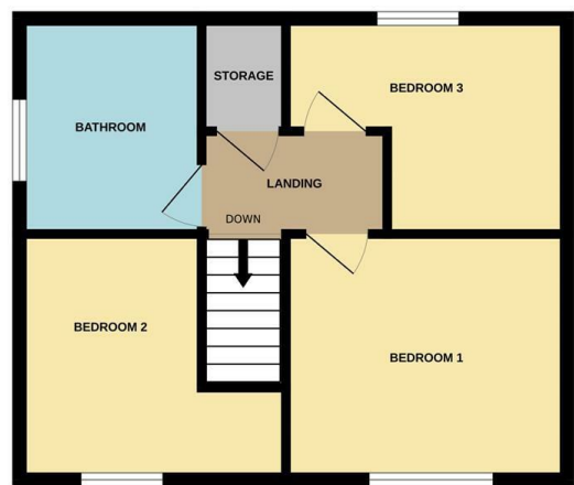
1ST FLOOR 415 sq.ft. (38.5 sq.m.) approx.