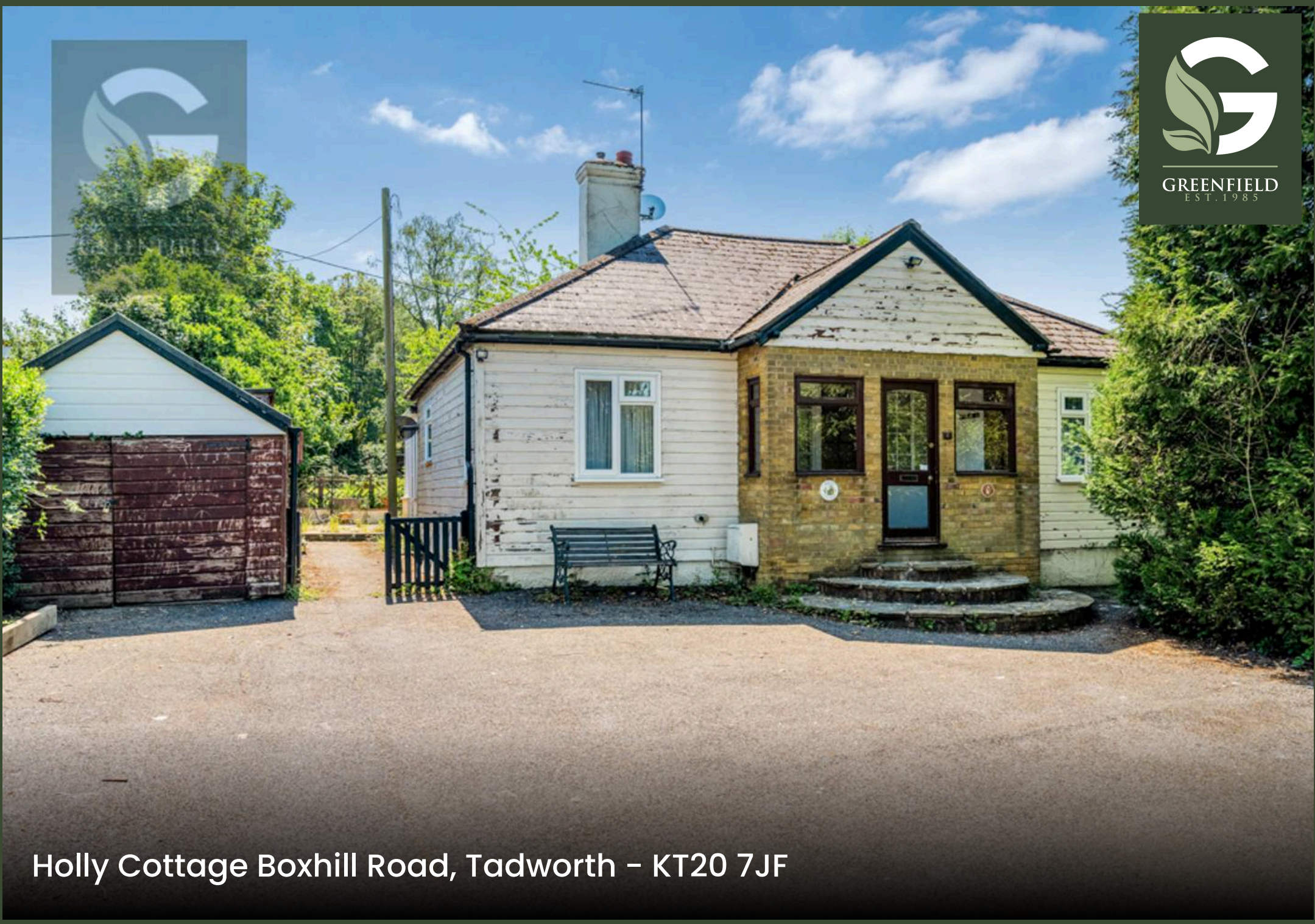
Holly Cottage Boxhill Road, Tadworth – KT20 7JF