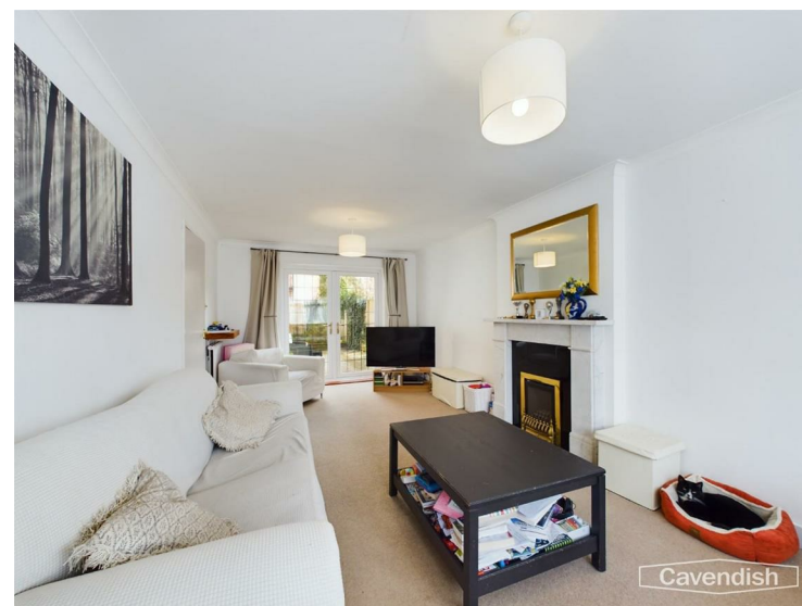
LIVING ROOM 6.58m x 3.25m (21'7" x 10'8")

Dual-aspect room with a UPVC double glazed window and UPVC double glazed French doors to outside, two TV aerial points, coved ceiling, two ceiling light points, two double radiators with thermostats, marble fireplace with granite insert and hearth housing a 'Living Flame' coal-effect enclosed gas fire.