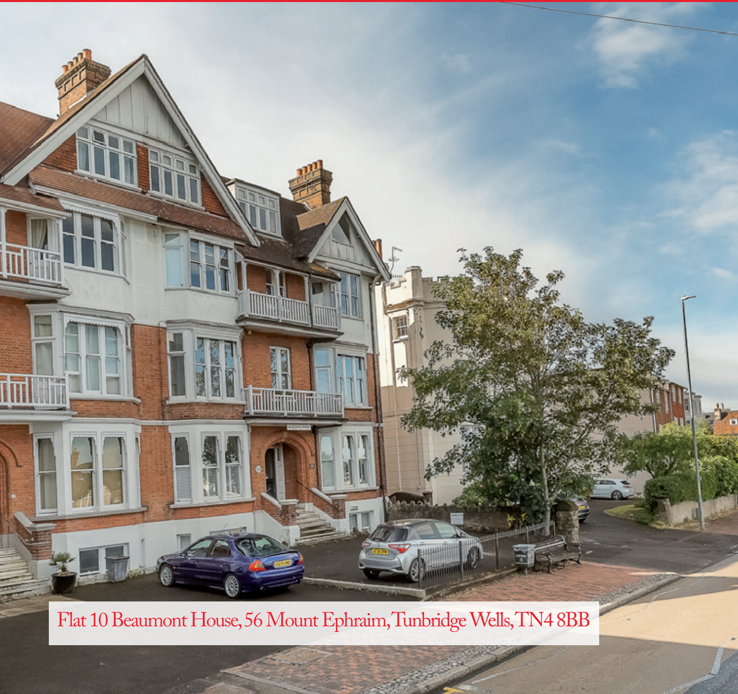
Flat 10 Beaumont House, 56 Mount Ephraim, Tunbridge Wells, TN4 8BB