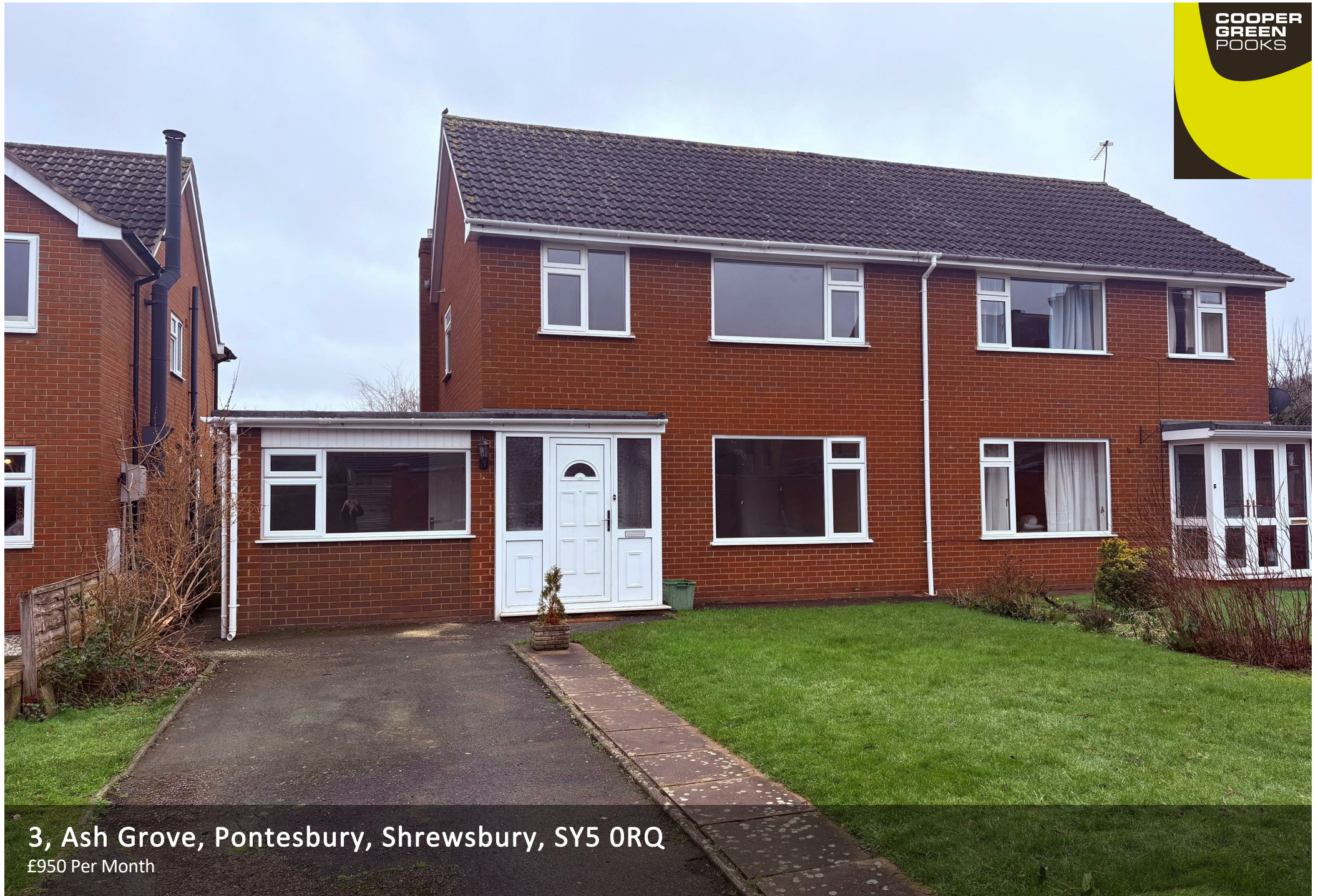
3, Ash Grove, Pontesbury, Shrewsbury, SY5 0RQ £950 Per Month