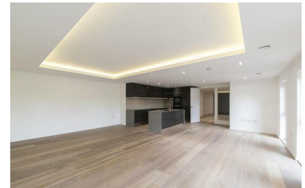
Landau Apartments, Farm Lane, Fulham, London SW6 1BQ £1,900,000