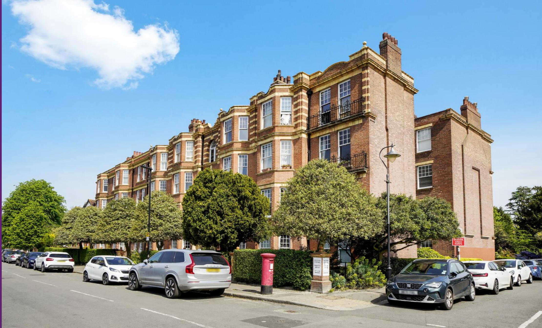
Sutton Court Fauconberg Road, W4