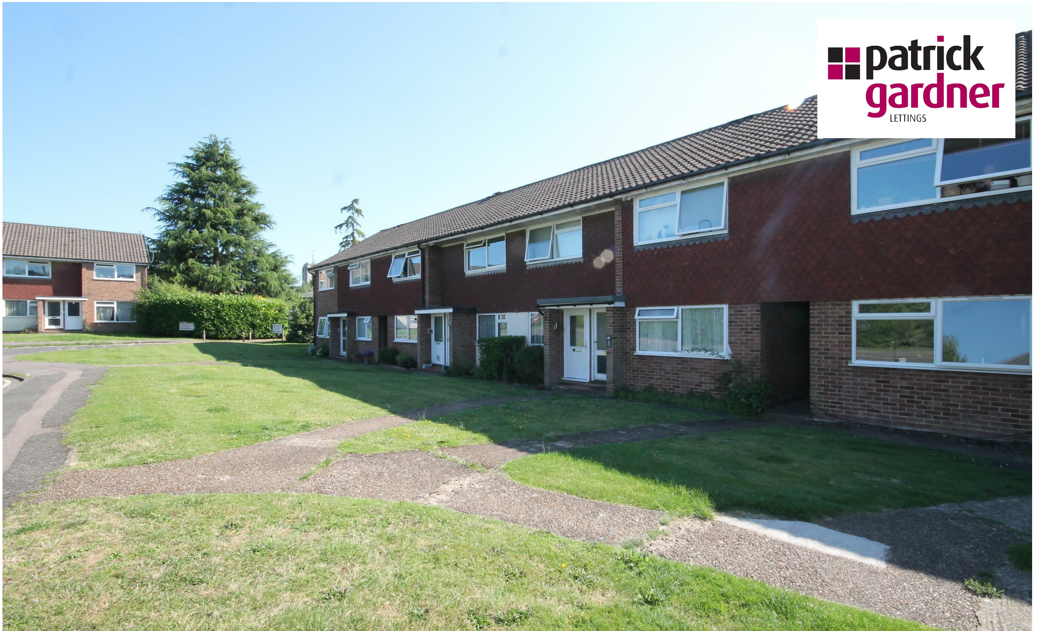
Russell Court, Leatherhead, KT22 8AR