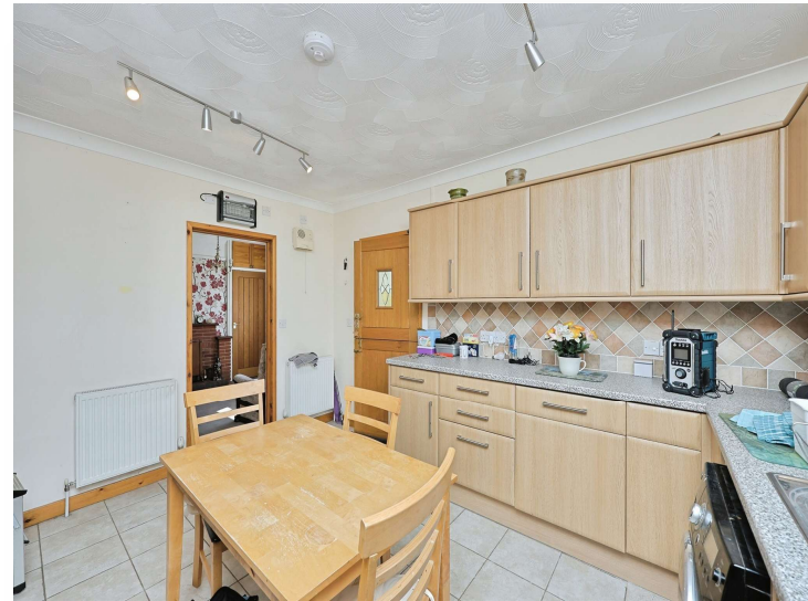
Yaxham Road, Dereham, NR19 1HR