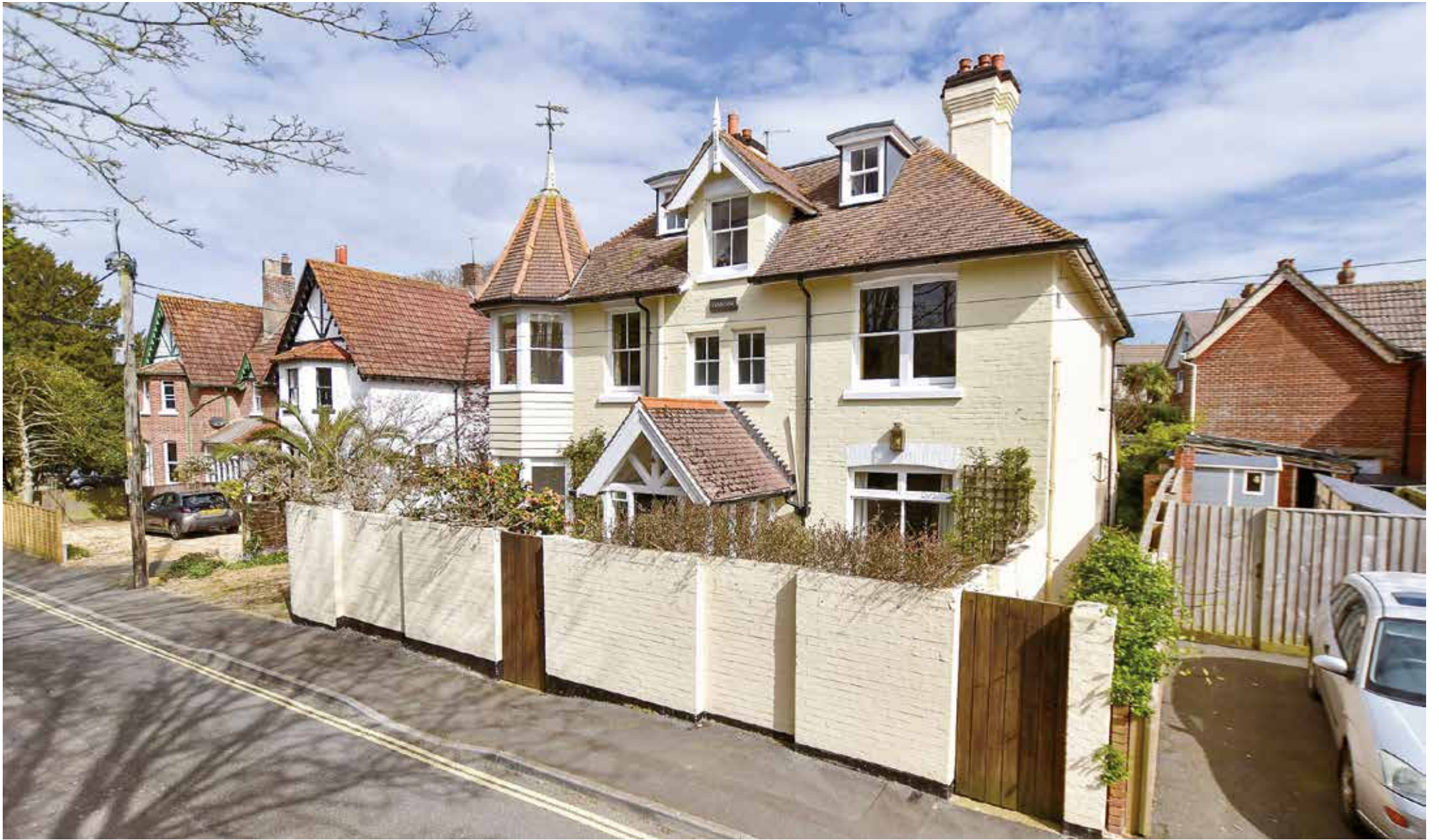
Whitefield Madeira Road | Totland | Isle of Wight | PO39 0BJ