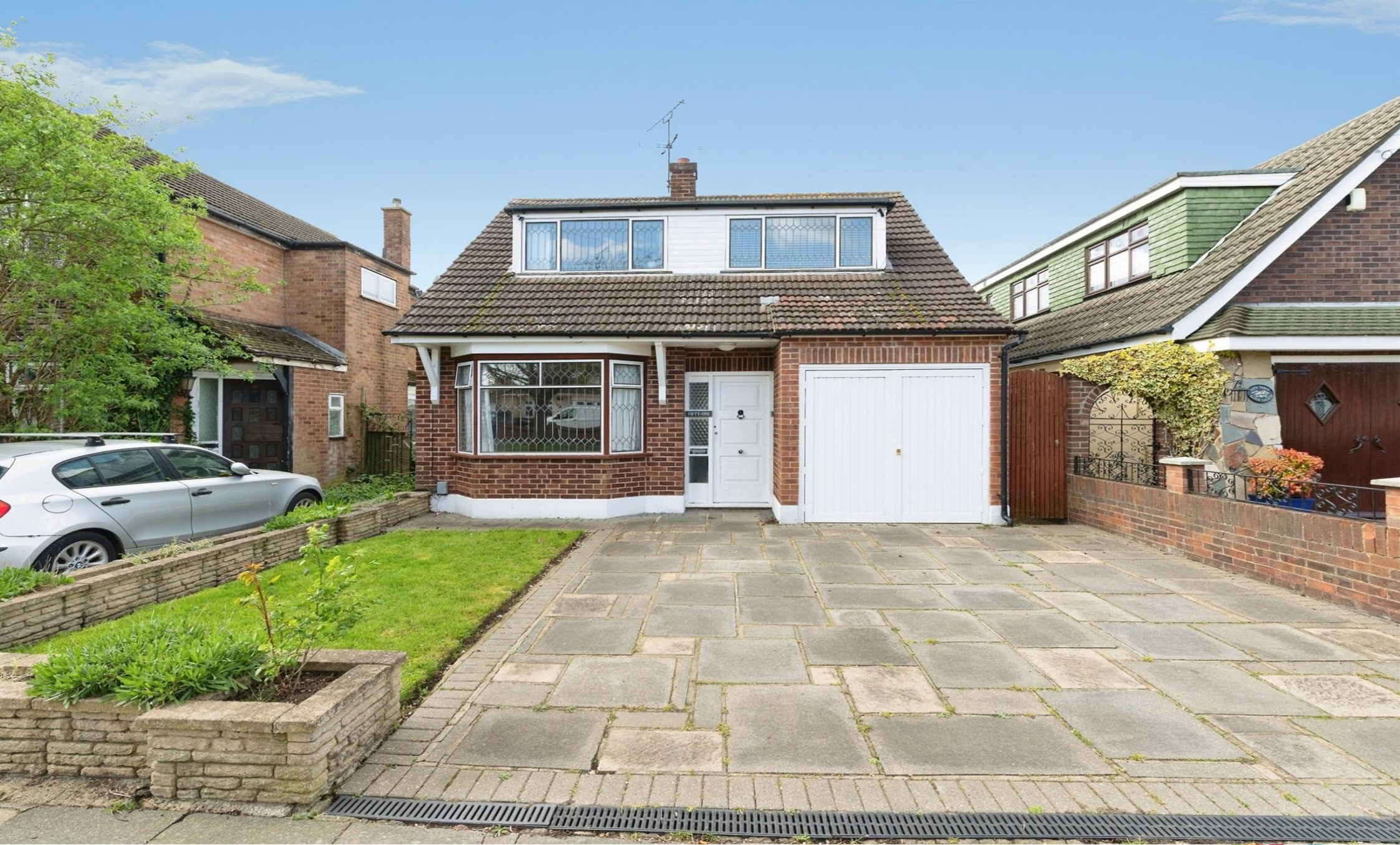
Elmer Gardens, Rainham, RM13 7BT