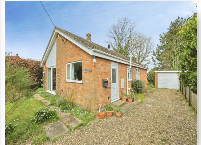
Flintwood Mattishall Road, East Tuddenham Dereham NR20 3LY