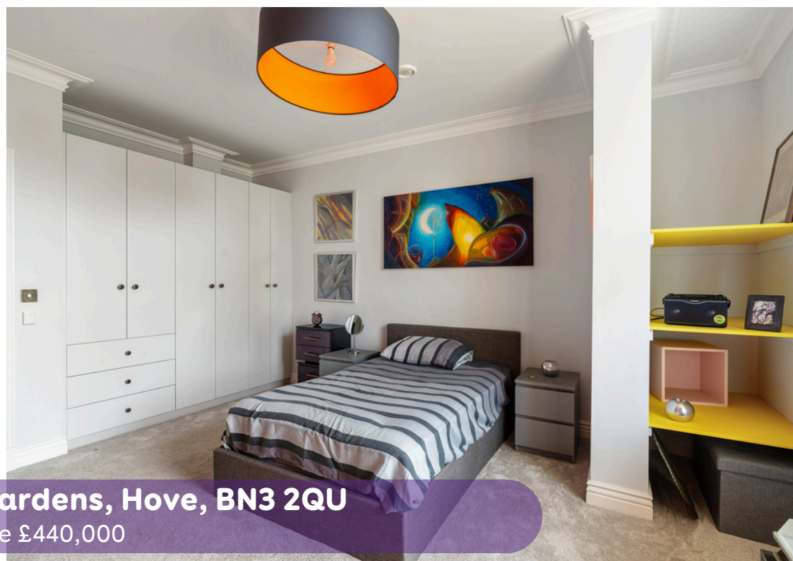
Kings House, Queens Gardens, Hove, BN3 2QU Asking Price £440,000