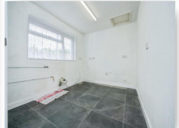
Upper Coombe, Linslade, Leighton Buzzard, LU7 2SQ