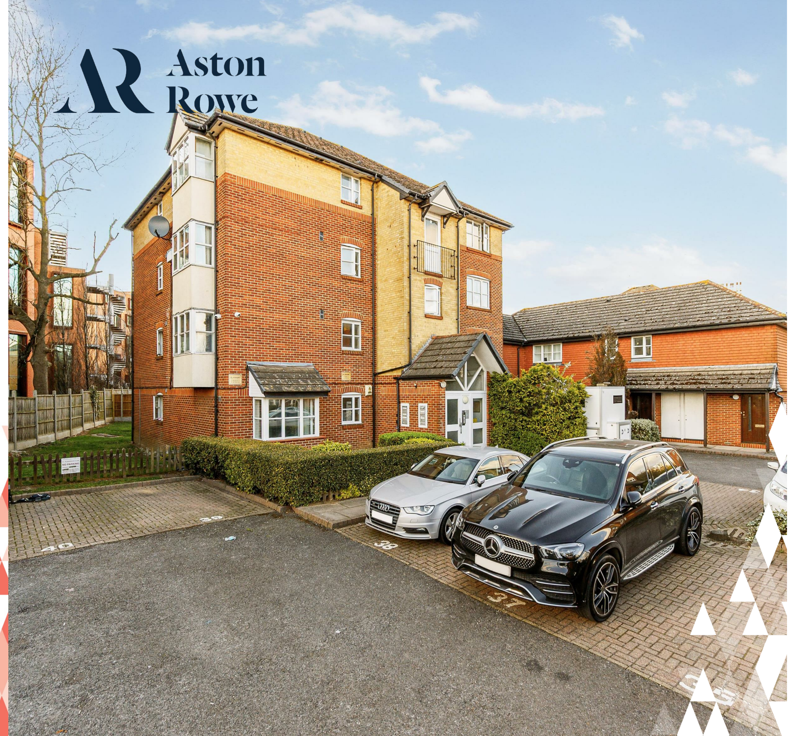
Anderson Close Approximate Gross Internal Area = 28.8 sq m / 310 sq ft