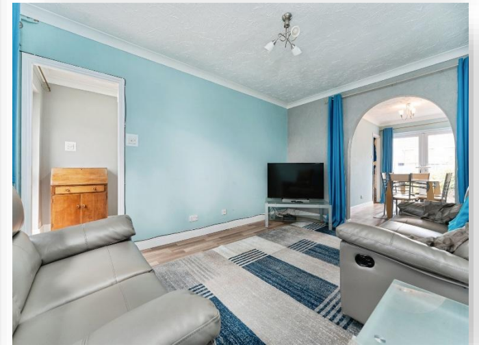
Sparkes Way, Feltwell, Thetford, IP26 4BX