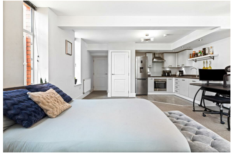
STUDIO ROOM 19'7" max x 15'7" (5.98 max x 4.77)

Front door, entry phone and fuse box attached to wall, radiator, door into