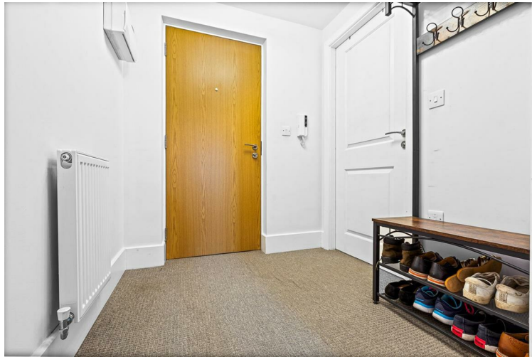
ENTRANCE HALLWAY 6'1" x 5'9" (1.86 x 1.77)

Currently rented out at £725 pcm excluding bills.