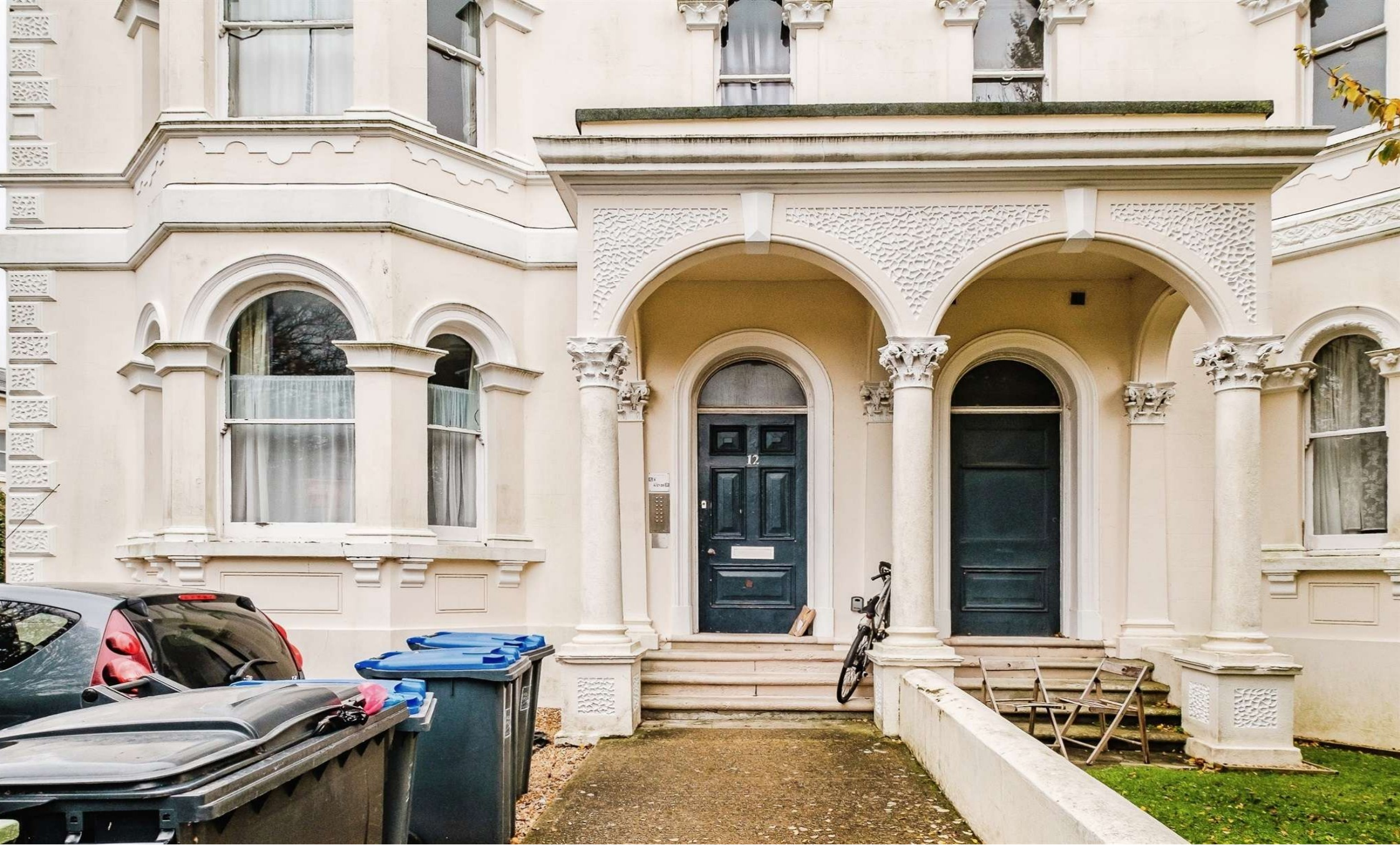
Farncombe Road, Worthing BN11 2BE