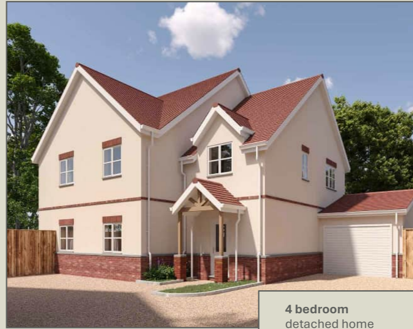
4 bedroom detached home with garage, 3 parking spaces and large garden