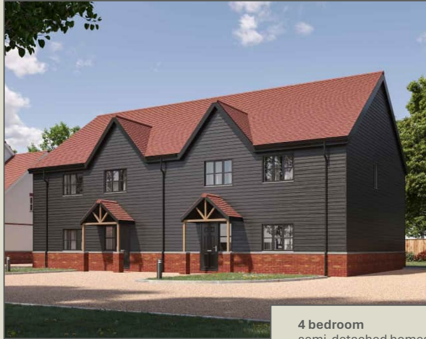
4 bedroom semi-detached homes with 2 parking spaces