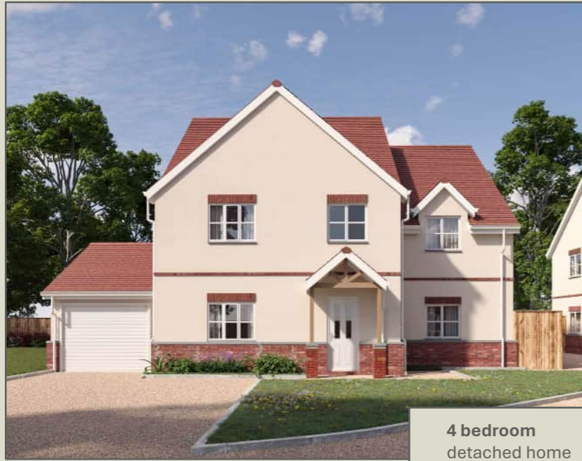
4 bedroom detached home with garage and 2 parking spaces