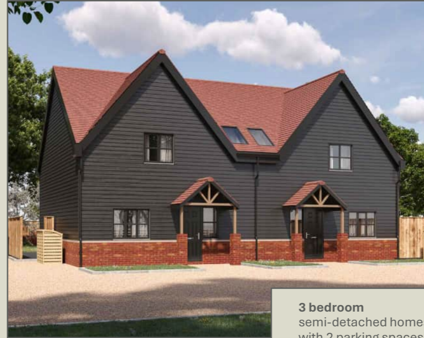
3 bedroom semi-detached homes with 2 parking spaces