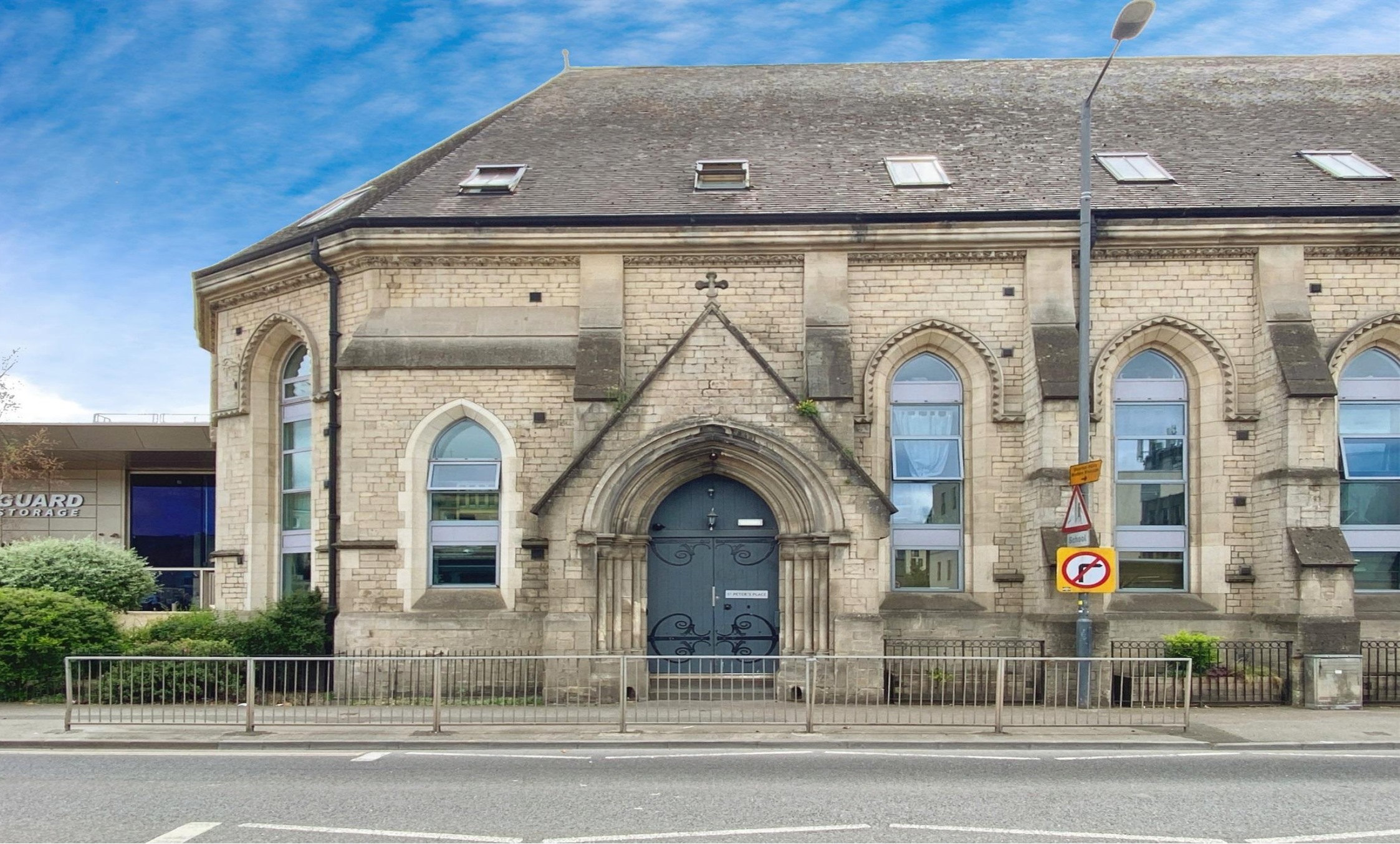
St. Peter's Place Lower Bristol Road, BATH BA2 3EP