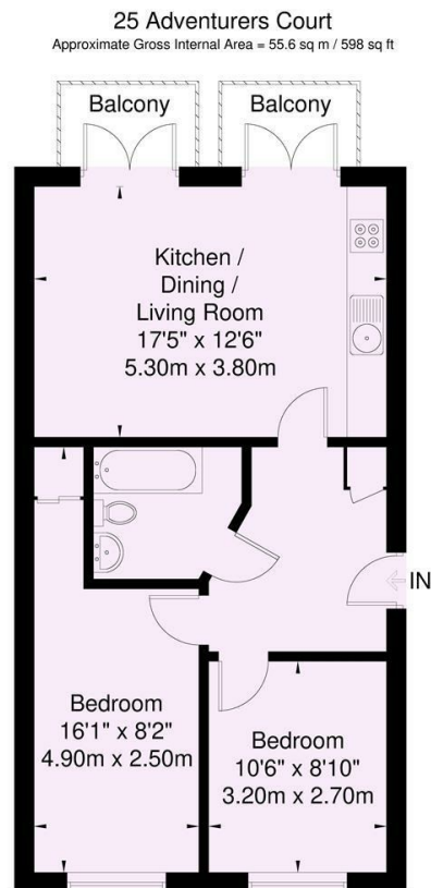
ILLUSTRATION FOR IDENTIFICATION PURPOSES ONLY ALL MEASUREMENT ARE MAXIMUM, AND INCLUDE WINDOW BAYS AND WARDROBES WHERE APPLICABLE THIS PLAN MUST NOT BE REPRODUCED BY ANY OTHER PERSON WITHOUT PERMISSION