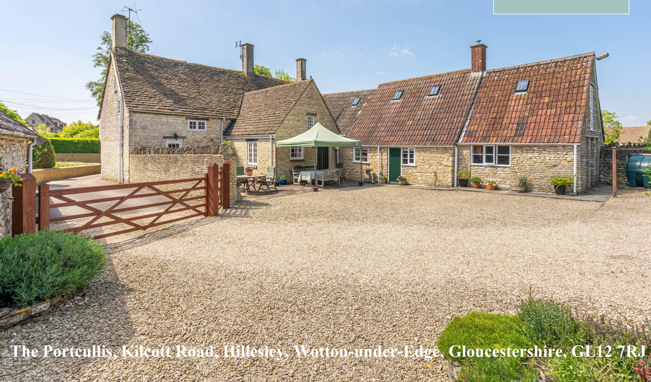
The Portcullis, Kilcott Road, Hillesley, Wotton-under-Edge, Gloucestershire, GL12 7RJ