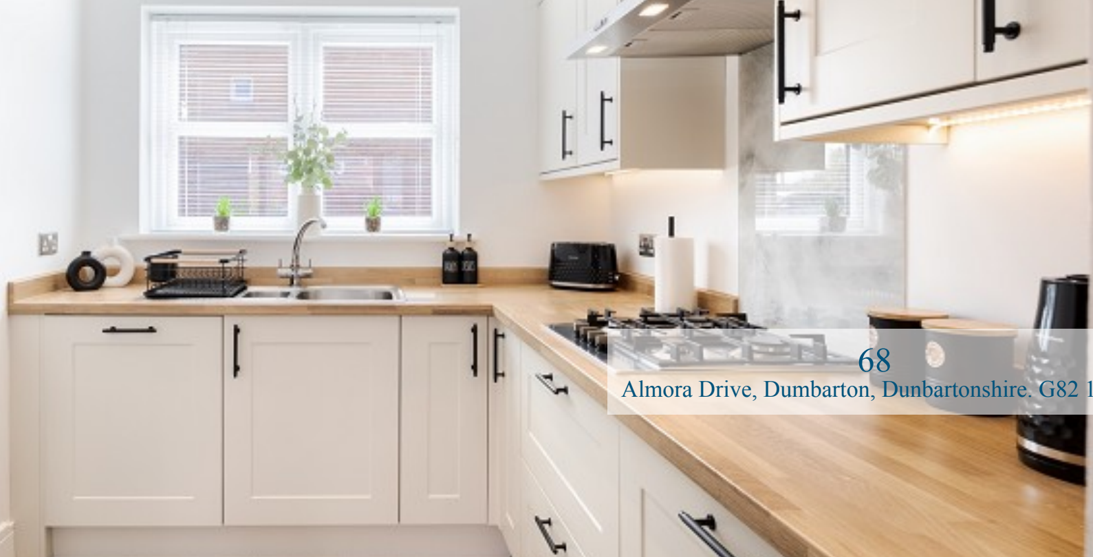
68 Almora Drive, Dumarton, Dunbartonshire. G82 1AE