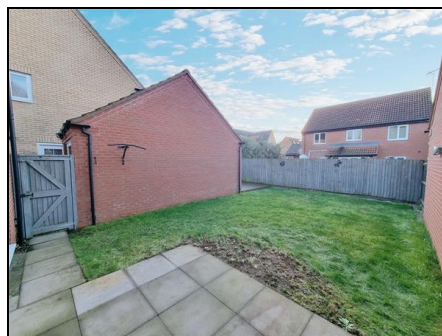
Further Garden Aspect