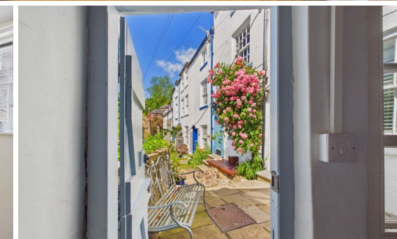
KENT HOUSE, BLOOMSWELL, ROBIN HOODS BAY- 3 bed Cottage -£375,000