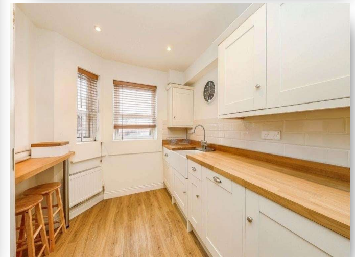
Brunswick Road, Norwich NR2 2TF