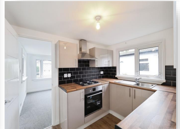
Palma Park Shelley Street, Loughborough