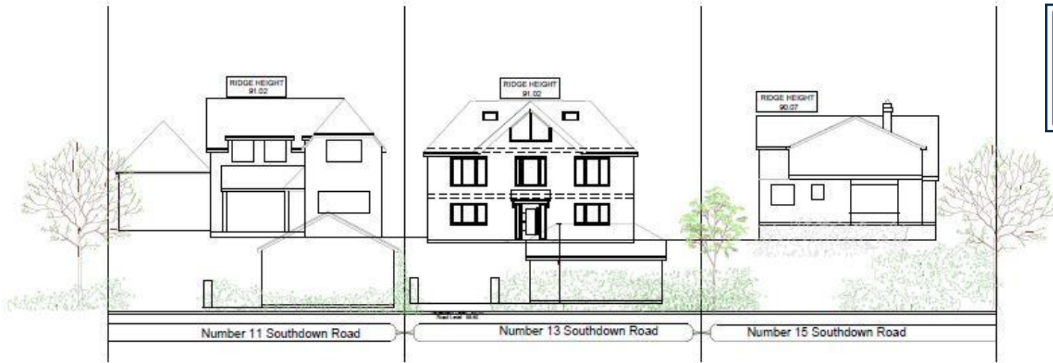
Proposed Street Elevation Scale A1 1:100, A3 1:200