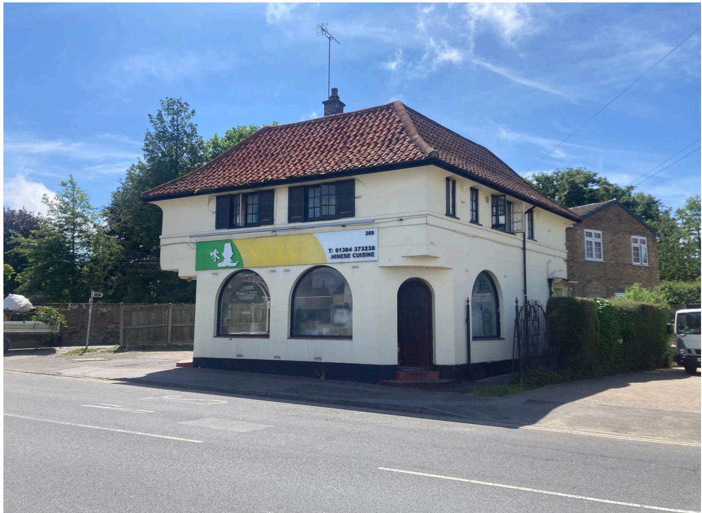
This property's energy rating is C. 269 - 269A London Road Takeaway Premises

This large, detached building has attractive arched windows to the main shop and a concave tented roof.