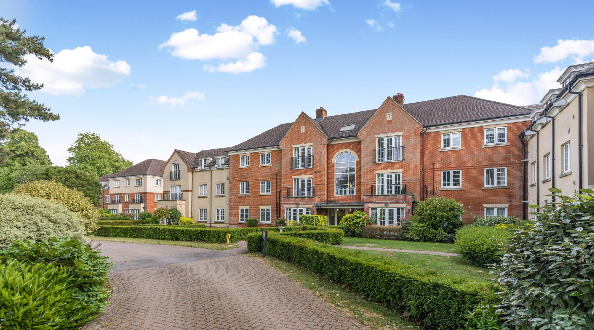
8 Janet Blunt House, Twyford Adderbury, Banbury, Oxon, OX17 3FL