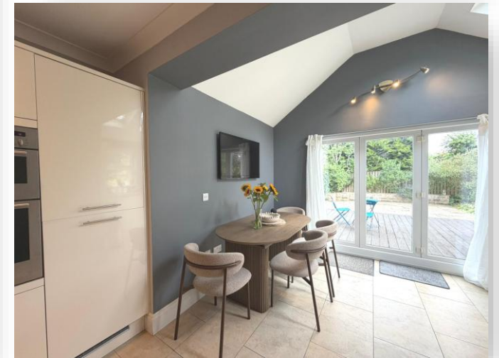
St. Thomas A Becket Walk, Hampsthwaite Harrogate HG3 2FS