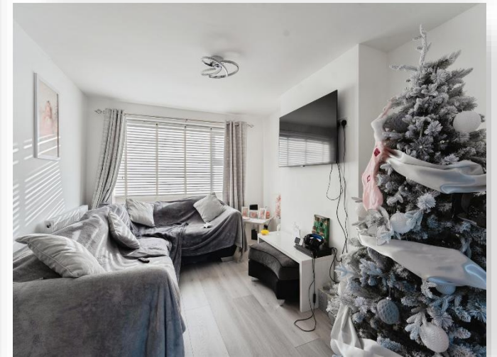
Holm Lane, Prenton, CH43 2HW