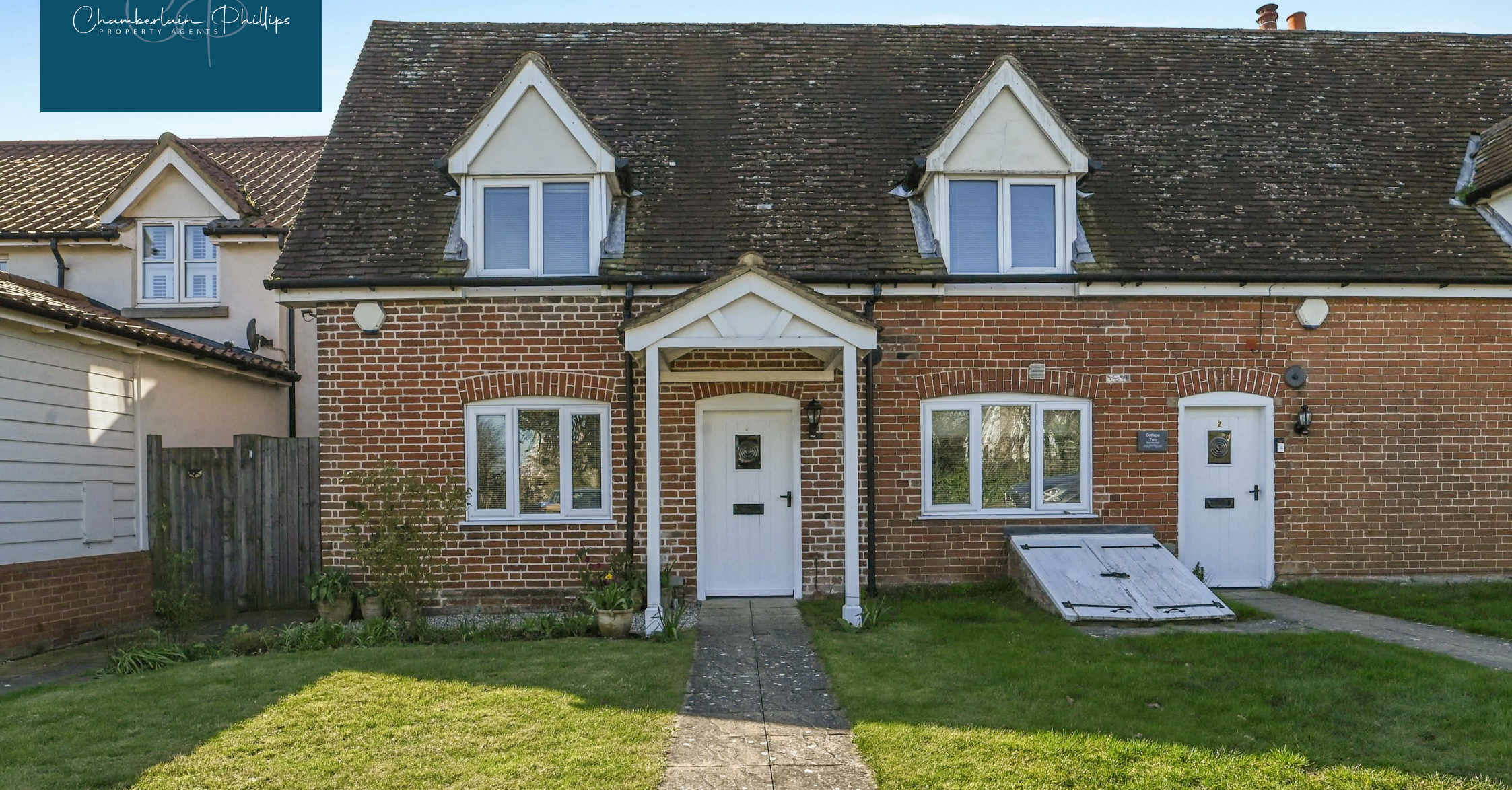
Bucks Horn Place, Belstead £290,000