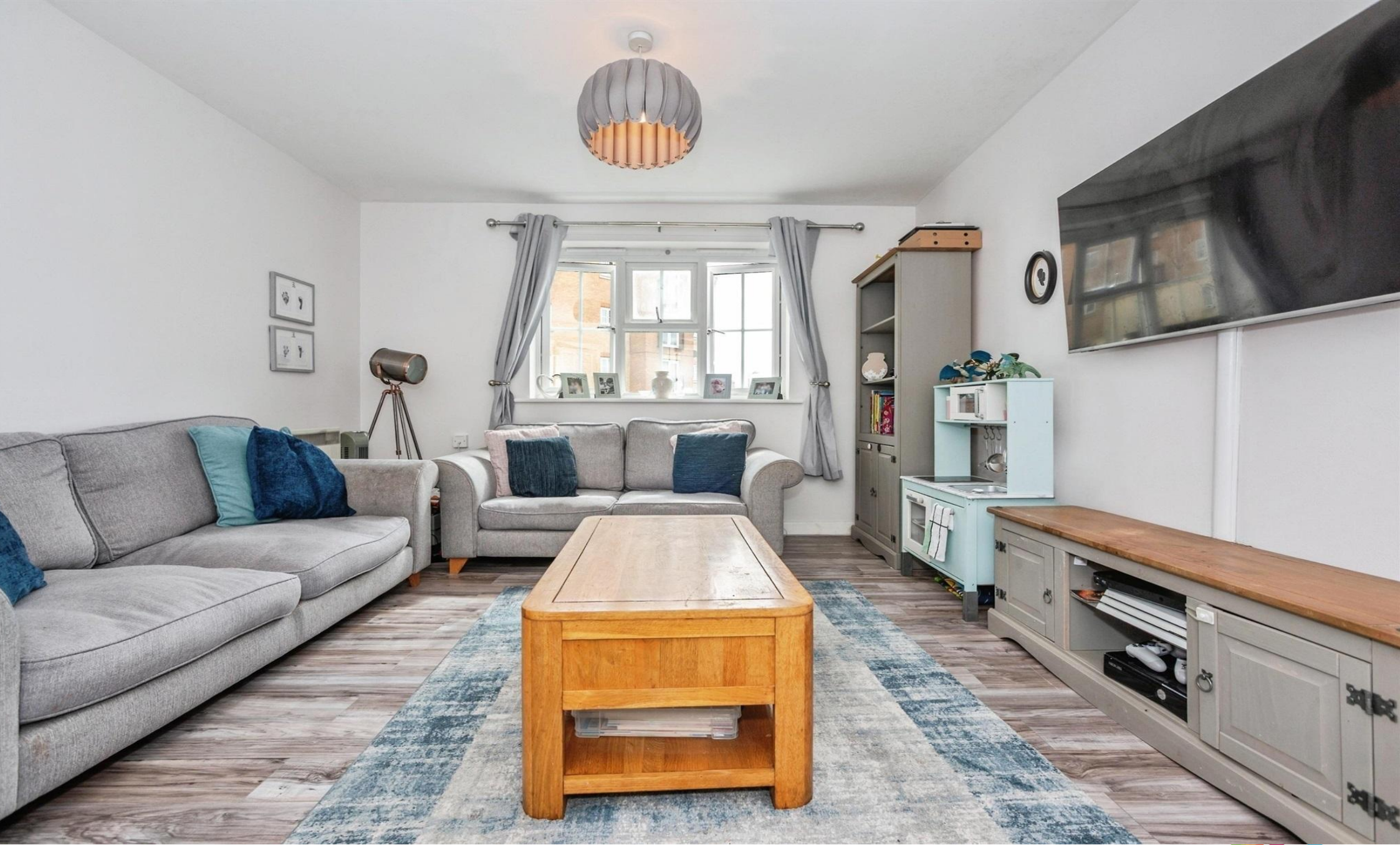
Kendal, Purfleet-On-Thames RM19 1LJ