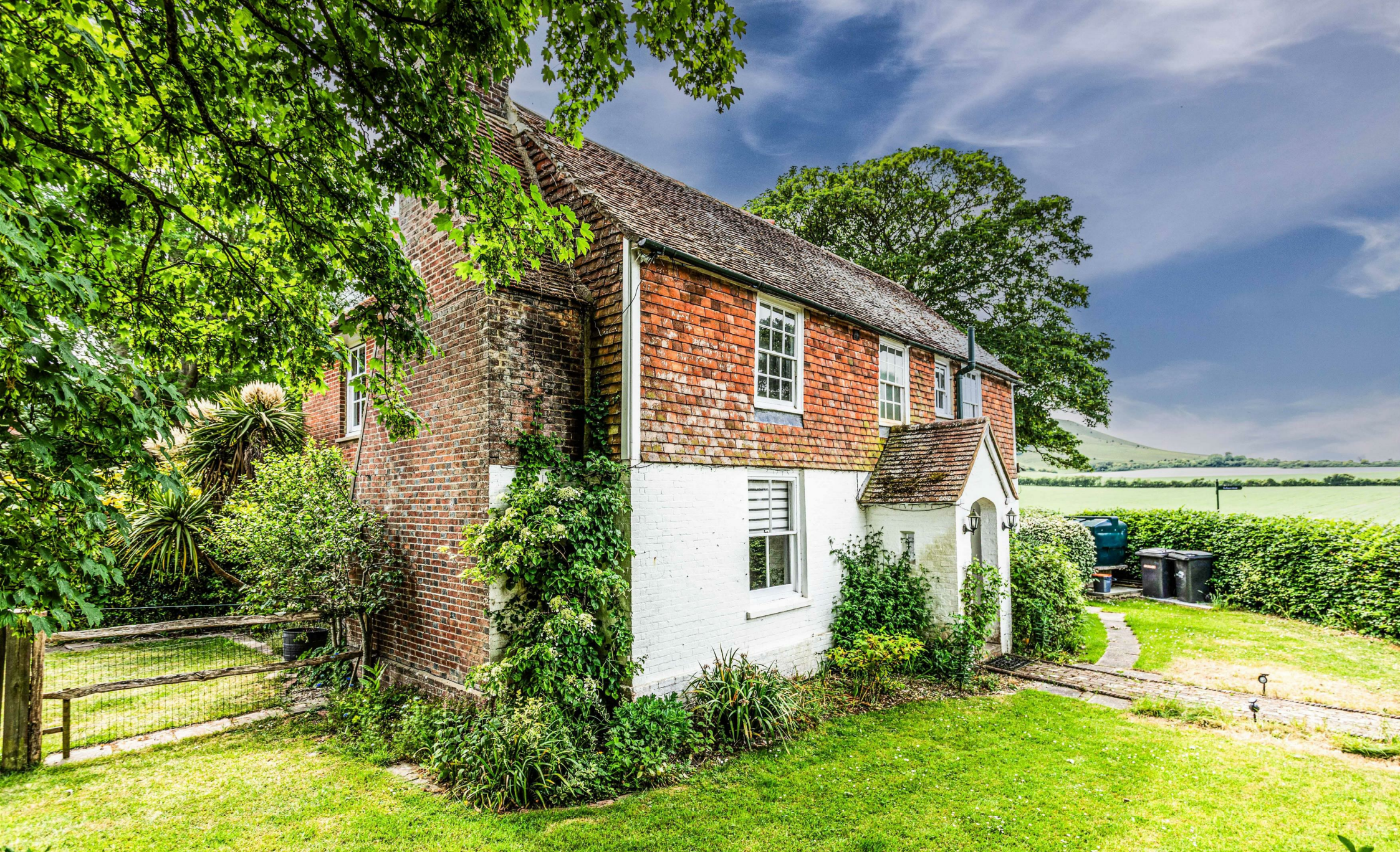
Bo-Peep Farmhouse Bo-Peep Lane, Alciston, BN26 6UJ