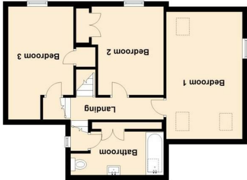
First Floor Approx. 50.9 sq. metres (547.6 sq. feet)

Total area: approx. 121.6 sq. metres (1308.4 sq. feet)