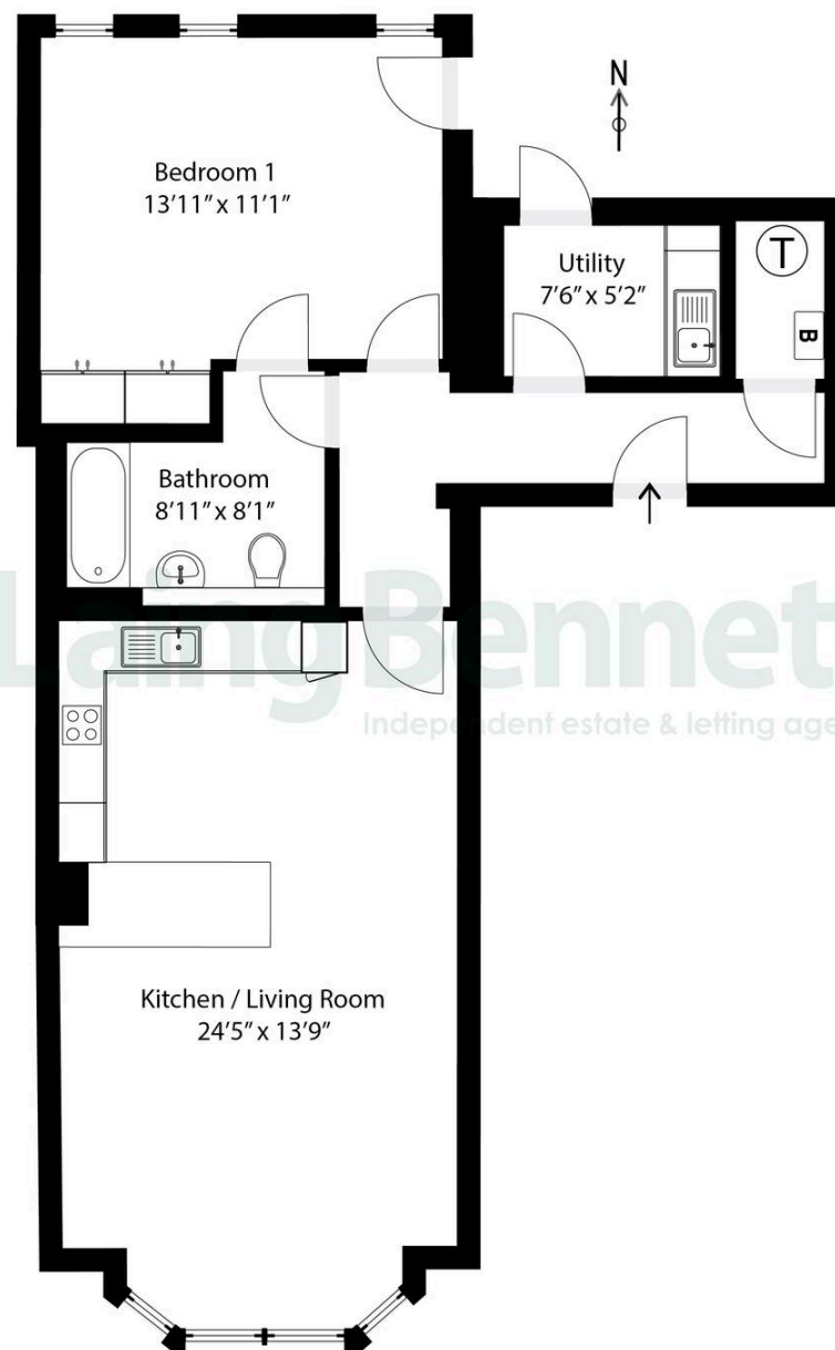
Illustration for Identification purposes only. Measurements are approximate. Dimensions given are between the widest points. Not to scale. Outbuildings are not shown in actual location.

Approximate Gross Internal Area = 65 sq m / 700 sq ft