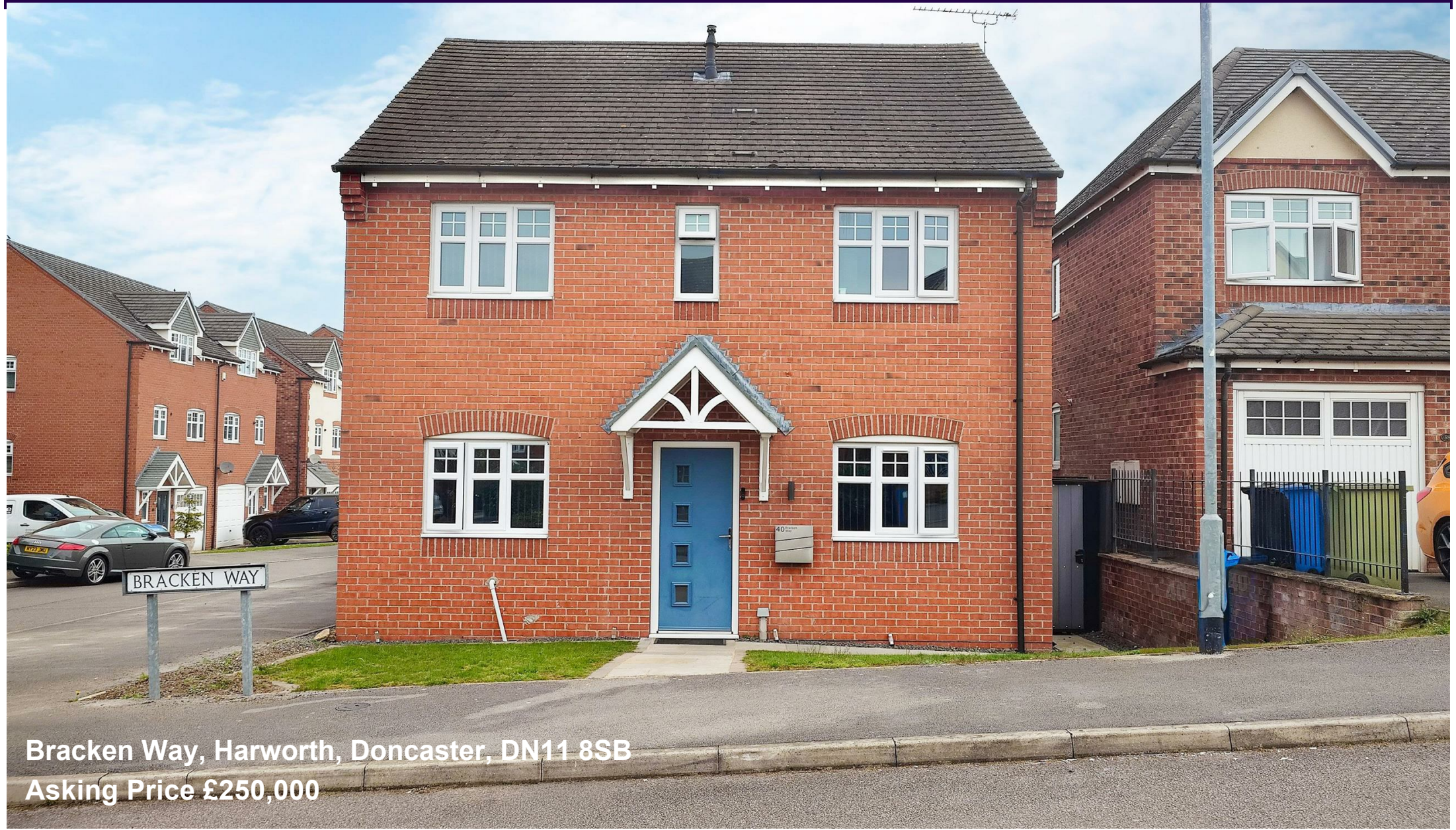
Bracken Way, Harworth, Doncaster, DN11 8SB Asking Price £250,000