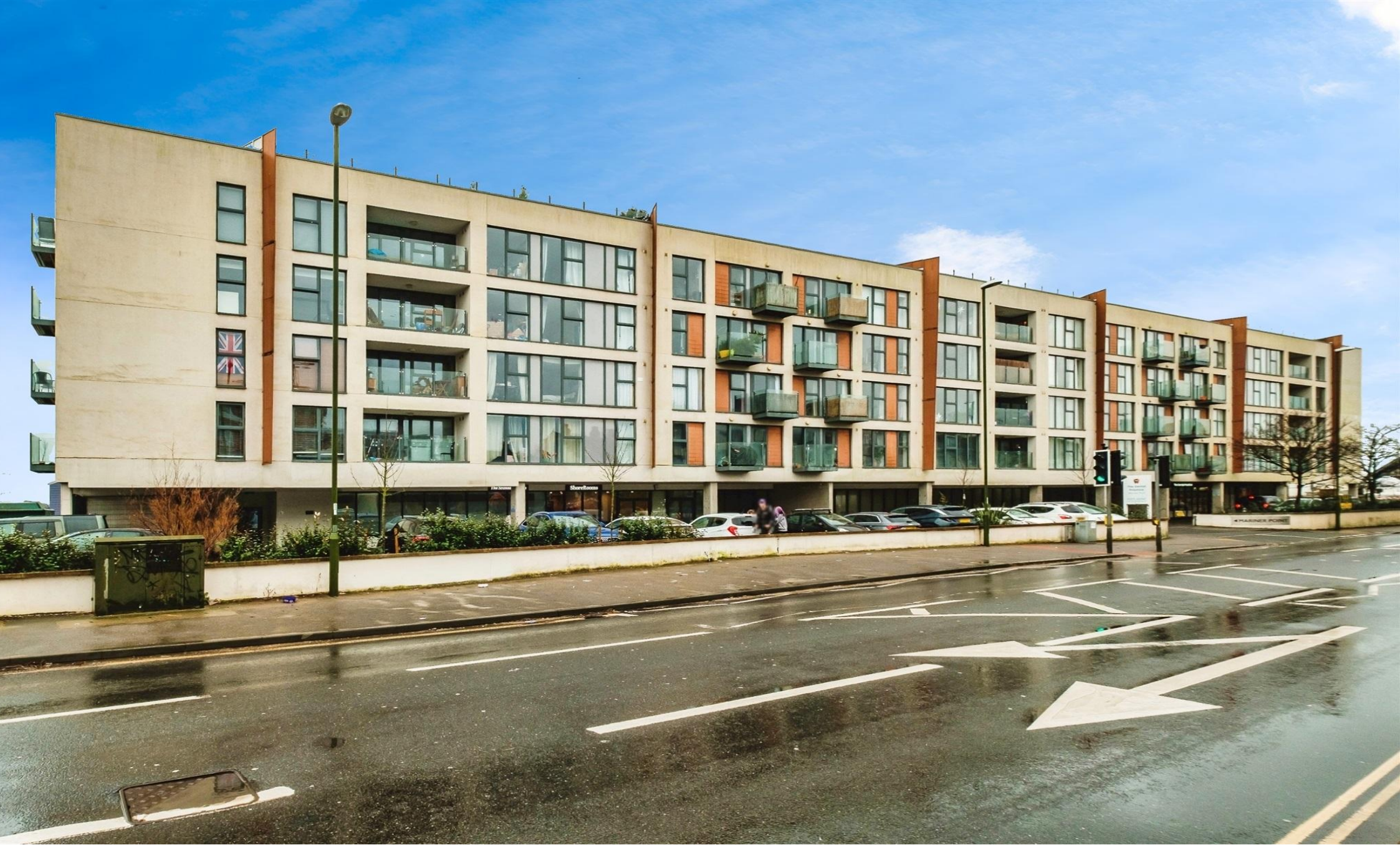
Mariner Point Brighton Road, Shoreham-By-Sea BN43 6DH